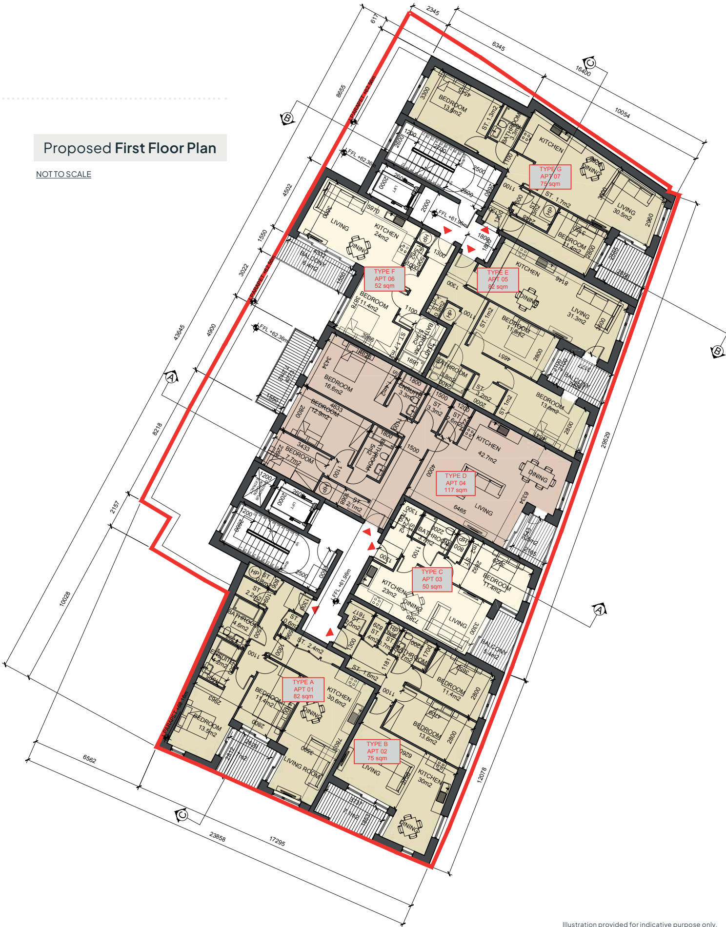
Illustration provided for indicative purpose only.