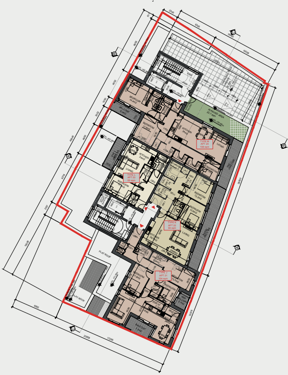
Proposed Fourth Floor Plans