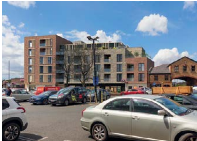
Illustration provided for indicative purpose only.