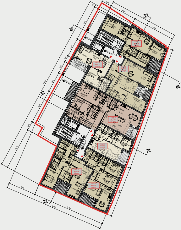
Proposed First and Second Floor Plans