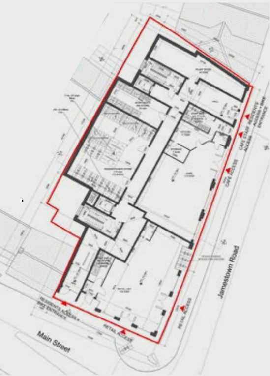
Proposed Ground Floor Plans